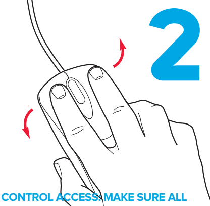
AREAS OF ACCESS TO THE SCHOOL NETWORK ARE PROTECTED.